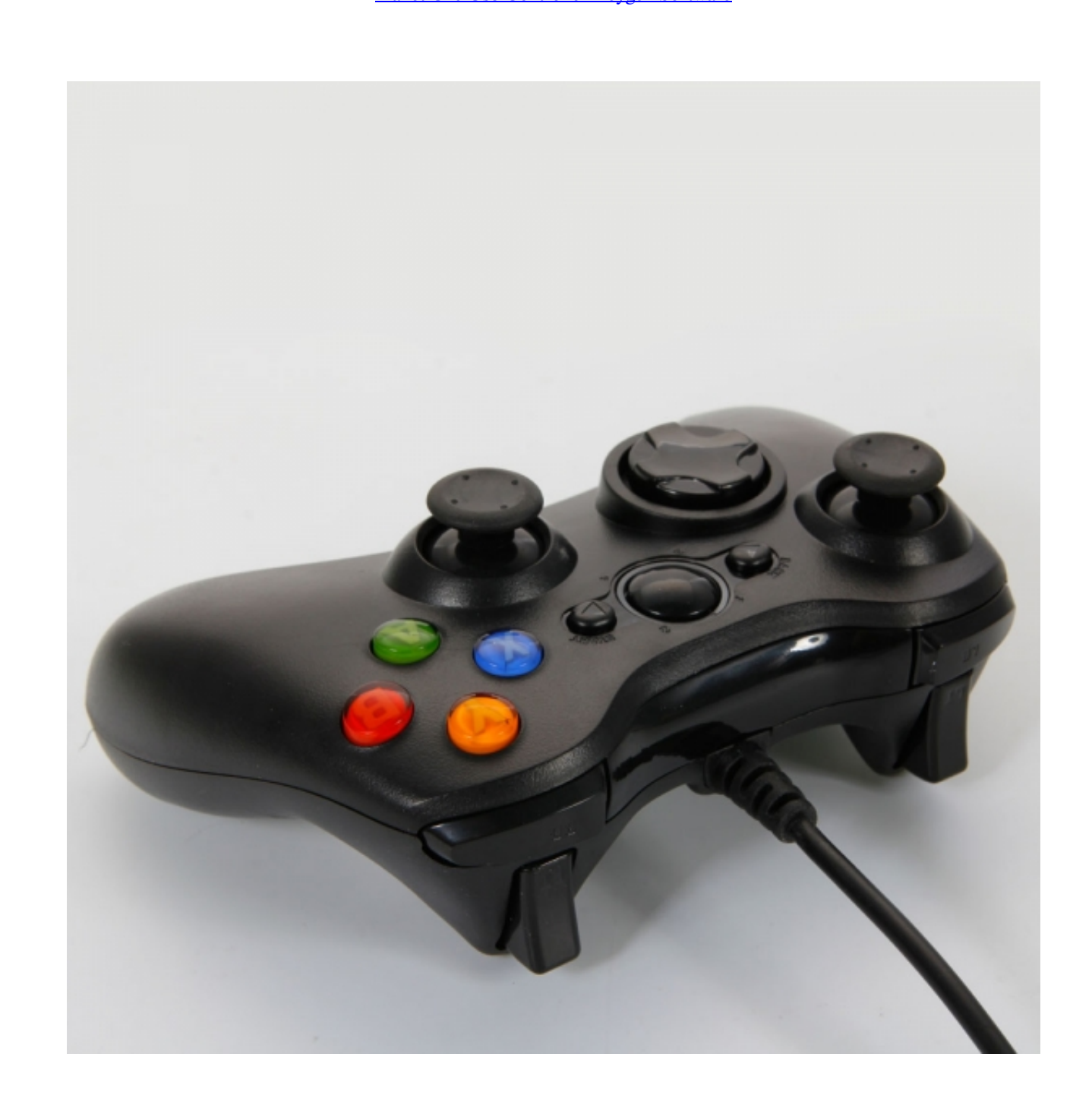
Planet Cnc Usb Controller Keygen Software